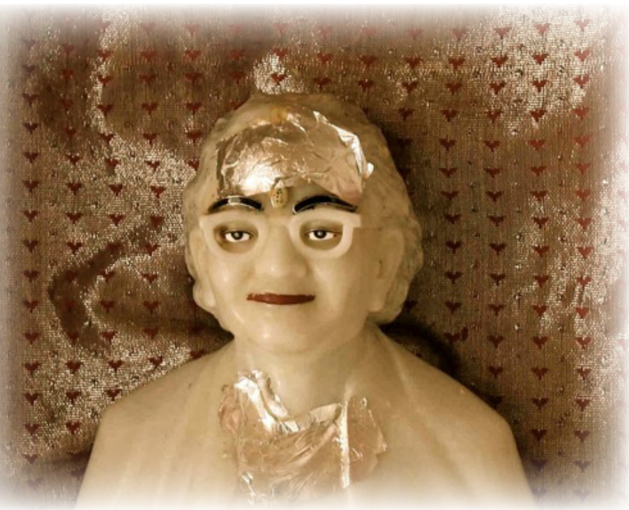
Jain temple, Jojawar

“To love is to see and to see is a form of Grace.”