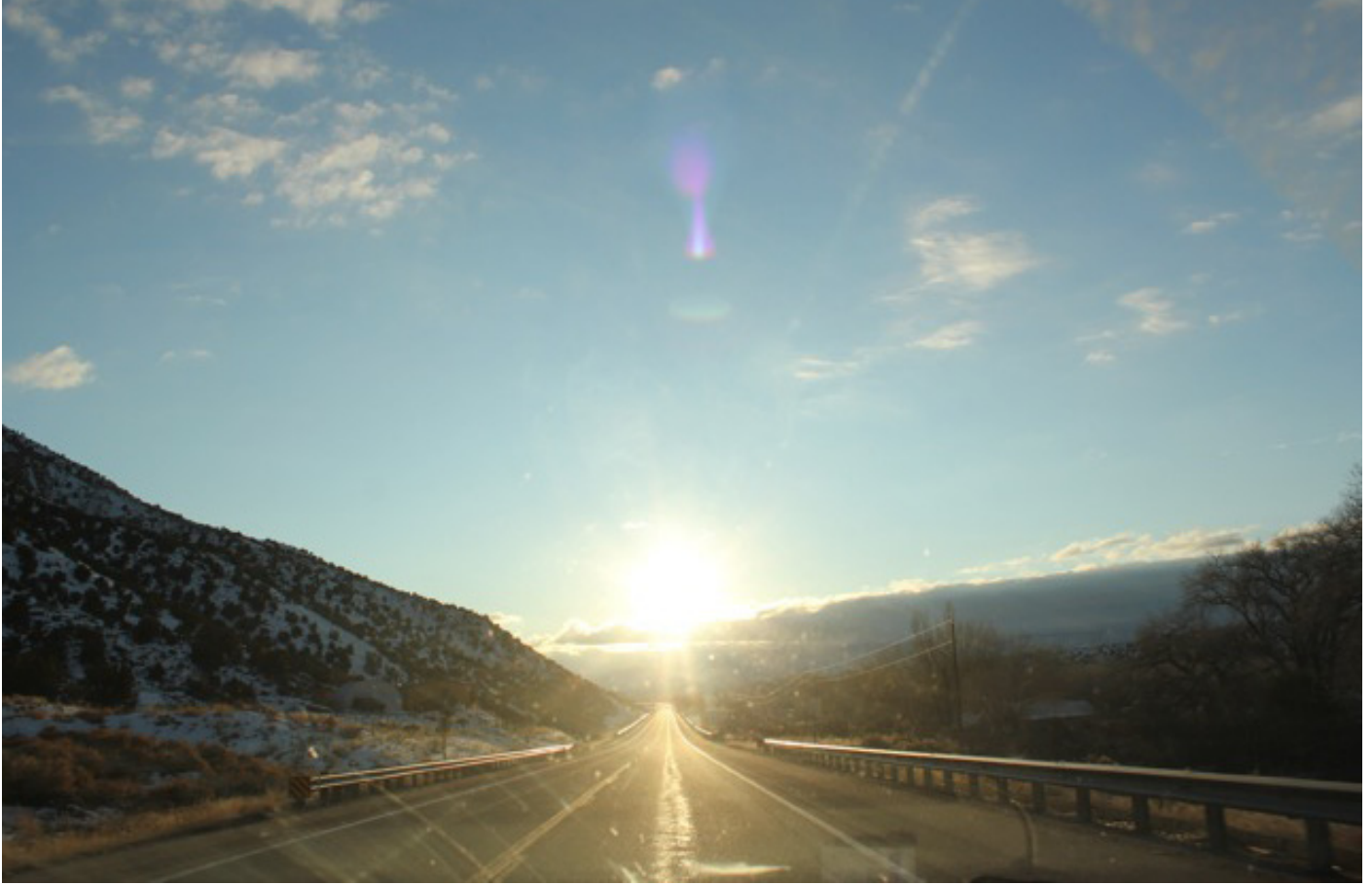
Photography " Occident ", the west