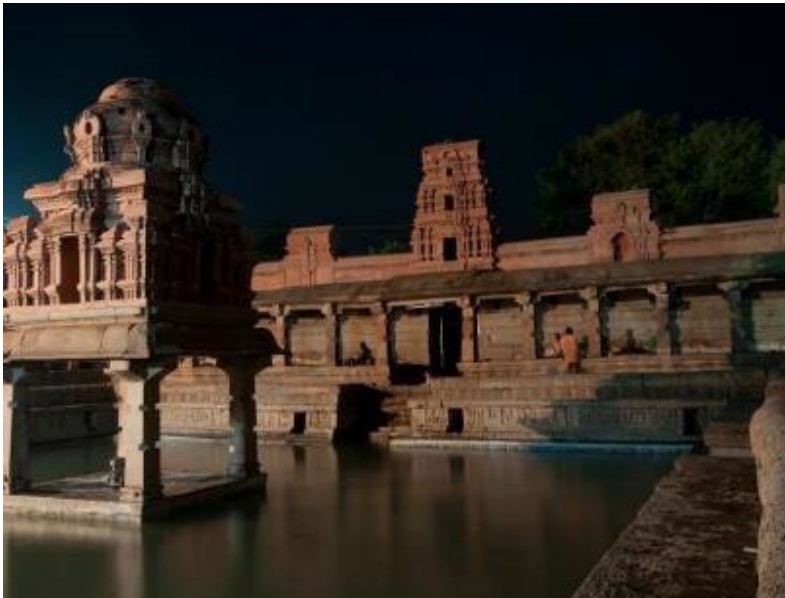
Travel Yaganti temple in Kurnool